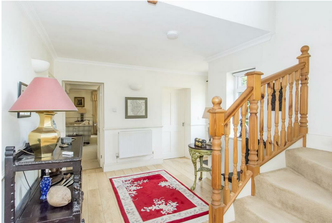
Entrance Hall 16'0" x 9'4" (4.88m x 2.84m)

Accessed via timber front door. Wood laminate flooring. Stairs rising to first floor. Double-glazed window to front elevation. Radiator. Two wall lights. Under-stairs storage cupboard. Doors to rooms.