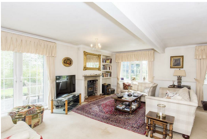
Lounge / Diner 19'3" x 15'7" (lounge area) plus 10'7" x 7'10" (di) (5.87m x 4.75m (lounge area) plus 3.23m x 2.39m (di))

Two double-glazed windows to side aspect. Double-glazed French doors opening out to rear garden. Feature stone constructed fire surround incorporating cast iron wood burner. Fitted book shelving in recesses. Television point. Two radiators. Dado rail.