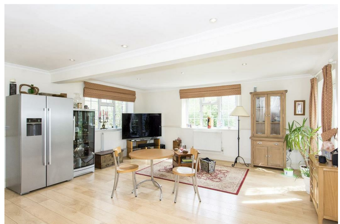
Kitchen/Family Room (Photo 2)

Double-glazed windows to rear and side aspects. Double-glazed French doors opening out to rear garden. Fitted base and wall units. Fitted solid quartz work surfaces. Wood laminate flooring. Two fitted base ovens. Five-ring electric hob with extractor hood over. Fitted automatic dishwasher. Fitted matching island and breakfast bar. Stainless steel double sink and drainer. Glazed door to utility room.