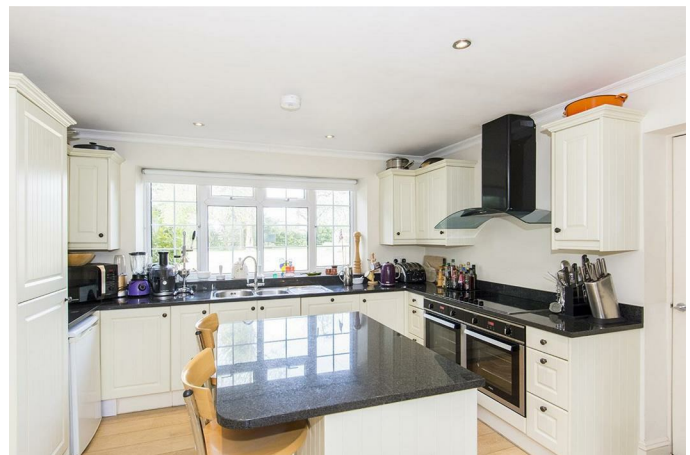
Kitchen / Family Room 25'8" max x 17'3" (7.82m max x 5.26m)

Double-glazed windows to rear and side aspects. Double-glazed French doors opening out to rear garden. Fitted base and wall units. Fitted solid quartz work surfaces. Wood laminate flooring. Two fitted base ovens. Five-ring electric hob with extractor hood over. Fitted automatic dishwasher. Fitted matching island and breakfast bar. Stainless steel double sink and drainer. Glazed door to utility room.